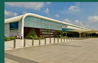
Gannavaram Airport - 20 mins