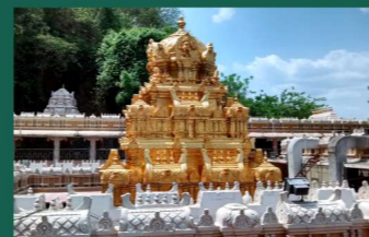
Durgamatha Temple - 15 mins