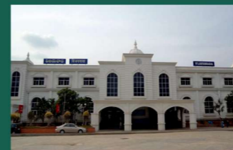
Railway Station - 20 mins