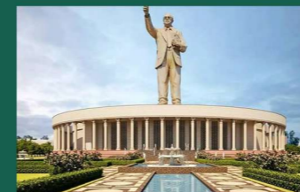
Ambedkar Statue - 20 mins